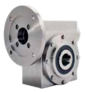
Standard stainless steel worm gearbox