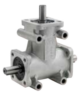
Right angle gearboxes

The planetary gearboxes are typically applied for servo solutions and positioning tasks and are available as straight or angle planetary gearboxes.