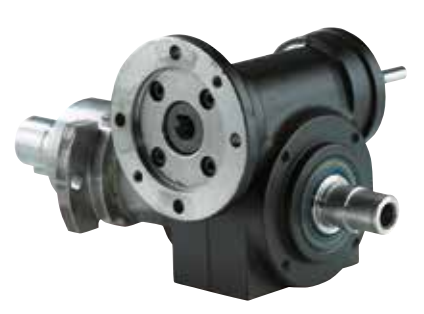
Worm gearbox with special output shaft and flange