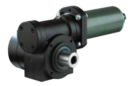
Worm gearbox with special motor flange, output shaft and reduced backlash