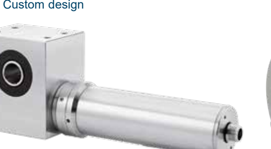
Stainless worm gearbox with a special motor flange for DC motor and a stainless motor shiel