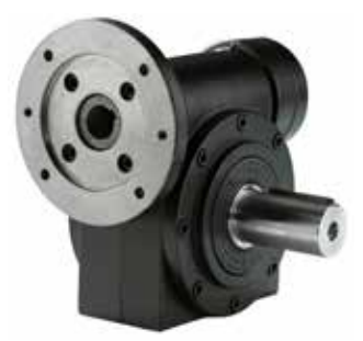
Worm gearbox of cast iron