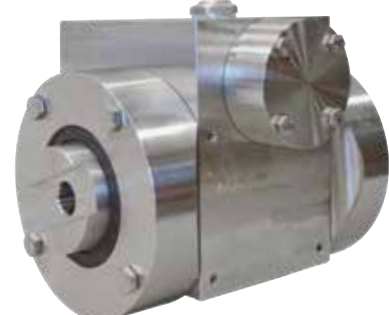
Integrated stainless steel worm gearbox with enhanced bearings and special output shaft