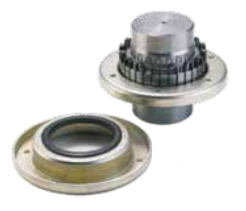
We have a large stock of flexible couplings from French CMD. CMD produces couplings from 52 Nm up to 7.780 kNm for shaft diameters from 28 up to 800 mm.

We supply elastic couplings and claw couplings from German R+L Hydraulics. They are available in aluminium, cast iron/sintered steel and as flange couplings in cast iron.