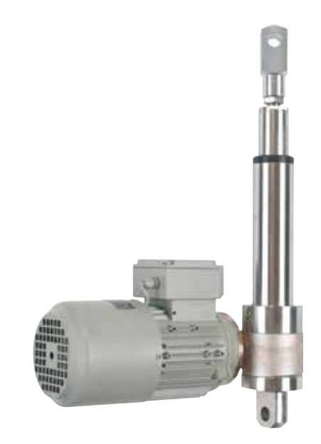
Actuator with inner and outer tubes in stainless steel