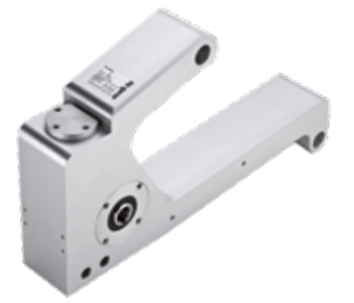
Special gearbox solution integrated in a lever arm