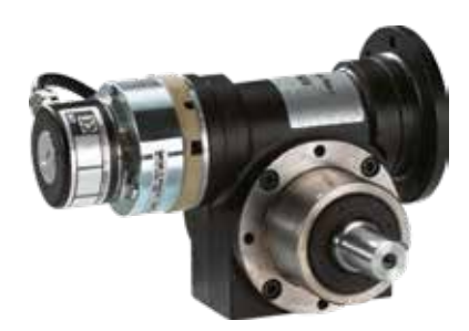
Worm gearbox with special worm shaft for brake and encoder and special output flange