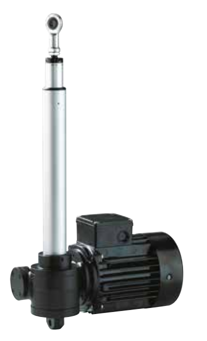
ATEX approved actuator based on a worm gear drive. The actuator is mounted with cylindrical aluminium tubes and an inner threaded spindle