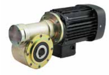
Yellow chromated worm gearbox with motor