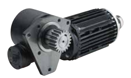
Worm gearbox with special output shaft and flange