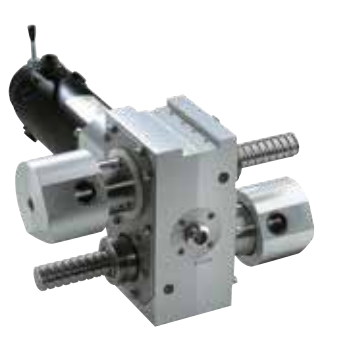
Double acting worm gear screw jacks with ball screw, servo motor and brake