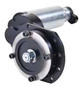
2-step helical gearbox with DC motor, brake and encoder