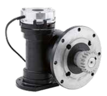
Worm gearbox with special motor flange, output flange and brake