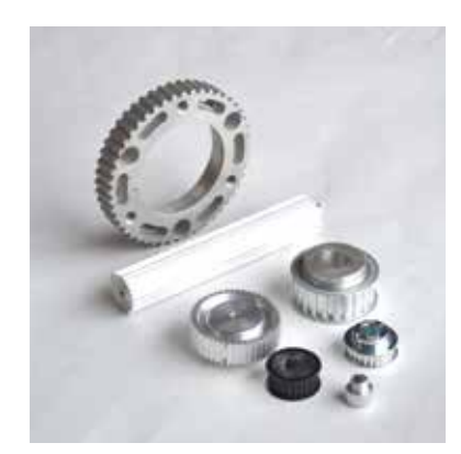
Timing belt pulleys Ø10 - Ø700 Millimeters, inch, AT and HDT type