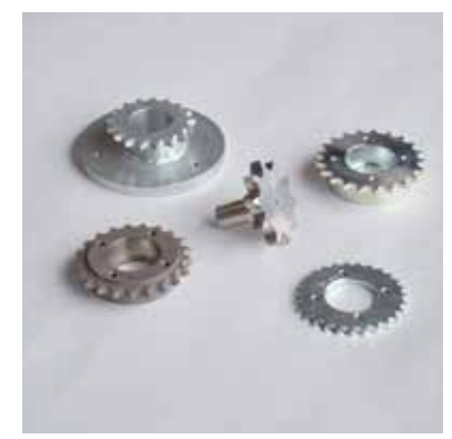
Sprocket wheels Ø5 - Ø700 All types