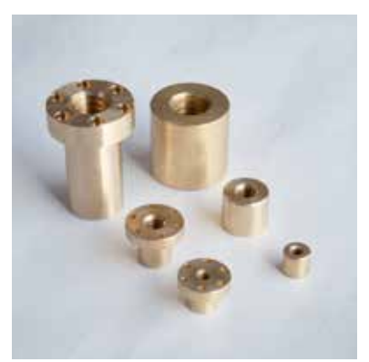
Trapezoidal nuts TR 10 - 140 DIN 103 ISO 2901/2902/2903/ 2904