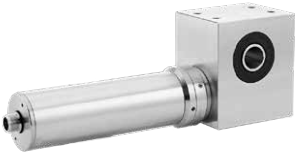
Stainless steel water cannon force 80TM with 3 special gear motors for rotation, elevation and adjustment of nozzle.