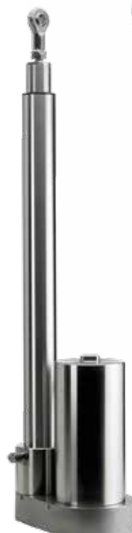
3 pcs stainless steel actuators for positioning