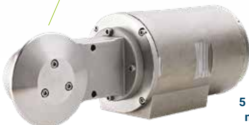
5 pcs stainless steel meat cutting saws