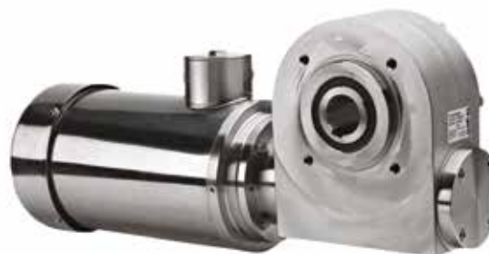
Stainless steel gear motor BJ-series 99