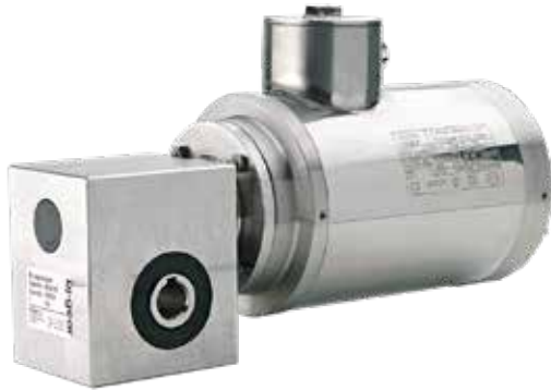
Stainless Steel Gear Motor BJ-Series 42

3 pcs Stainless Steel Gear Motors BJ-Series 61